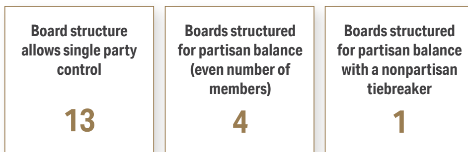
Figure 2: Party Control of State Election Boards

Only two states (Georgia and Hawaii) reserve a board seat for an individual required to be nonpartisan. In Georgia this position is of limited significance, since the majority party in the legislature can name three of the five members of the state's board. Aside from these two seats, no state board seats are reserved for any category of stakeholder in elections that would be analogous to judicial nominating commission seats for judges (discussed in Section III) or independent redistricting commission positions for third party or unaffiliated citizens (discussed in Section IV).