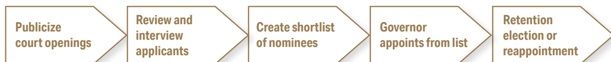
Figure 6: Selection of Judges with Judicial Nominating Commissions

The role of the JNC is provided for in the state constitution in 22 states. In five states, JNCs were first established by executive order of a governor (starting with Gov. Jimmy Carter of Georgia), and then repeated by subsequent governors.